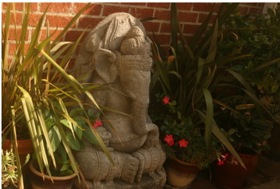
Zen atmosphere radiates through garden statues and foliage