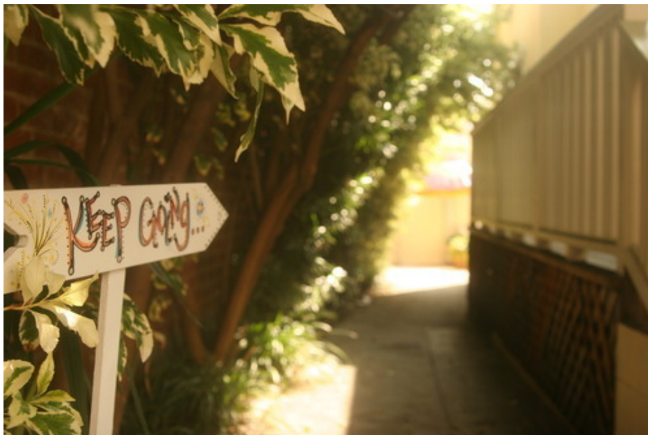
Secluded and serene - Facial Bungalow creates atmosphere before entrance

View the Full Article | Return to the Site