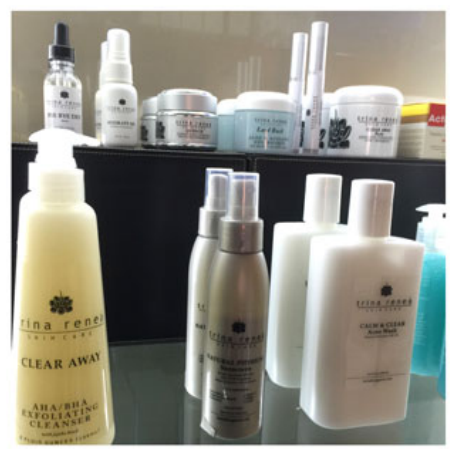
Press sample provided for honest review.